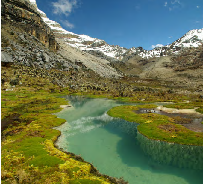
COPHAU, RIO NEGRO; ARGENTINA